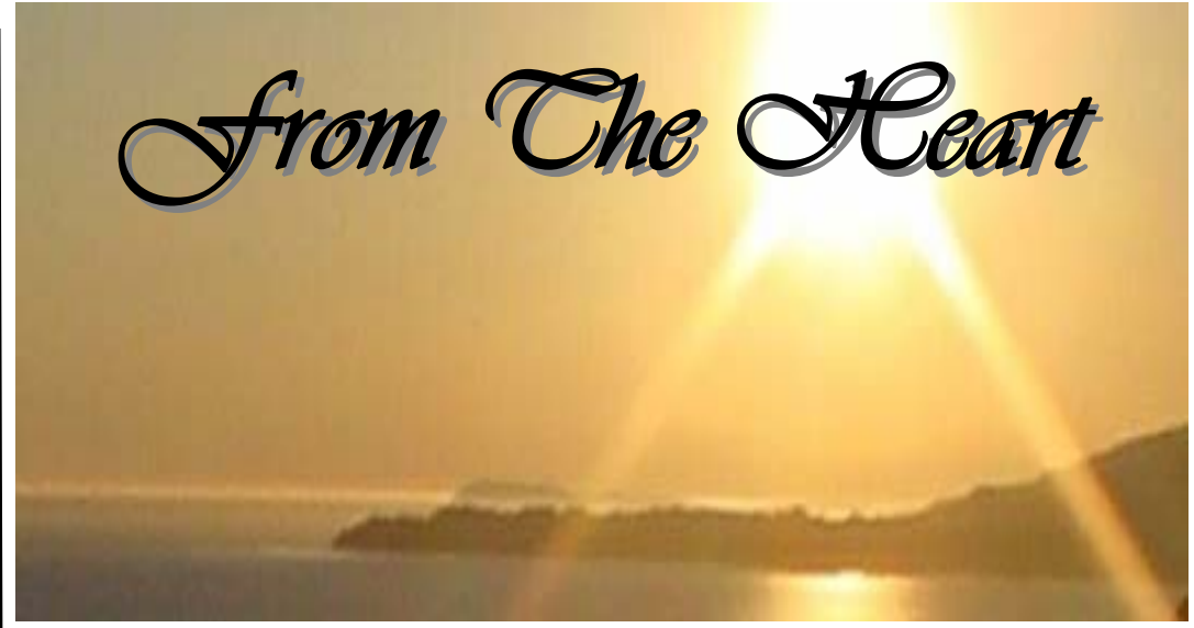
From the Heart - Volume I - Issue I - May 2008